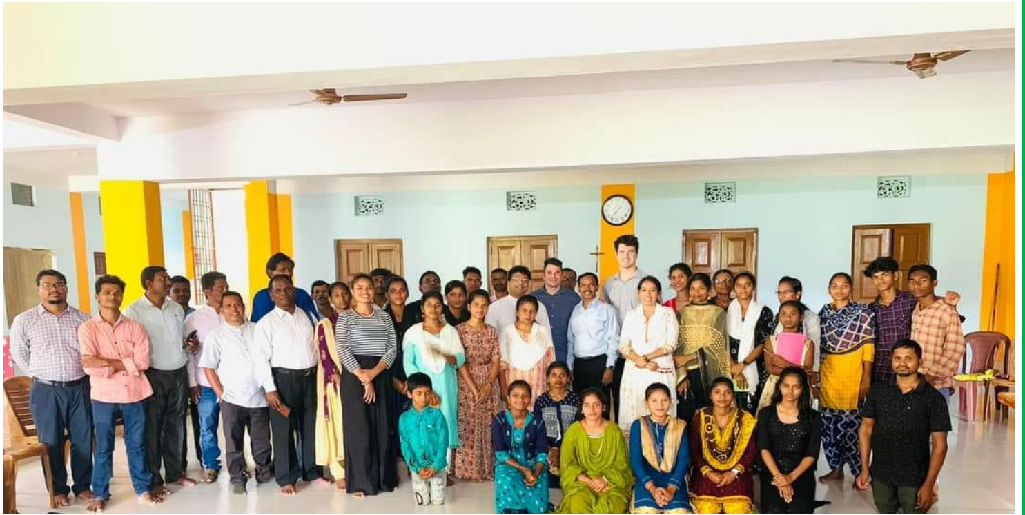
Youth gathering at ludru Parish